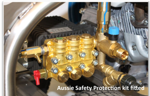
Aussie Safety Protection kit fitted

Bertolini pump kits for easy upgrades readily available